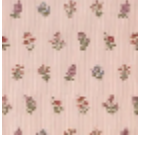
B7564001 Vieux rose