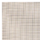
B7567001 Gris de lin