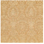
B7569001 Jaune d'or