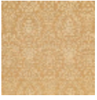
B7569001 Jaune d'or