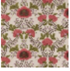
B7572001 Rose lilas