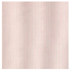
B7576001 Vieux rose