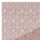
B7606004 Vieux rose