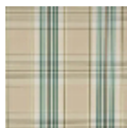
B7629003 Fleur d'oranger