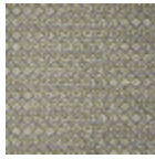
B7672004 Grandes eaux