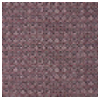
B7672002 Bleu garance