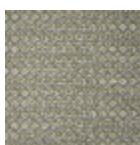
B7672004 Grandes eaux