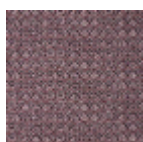
B7672002 Bleu garance