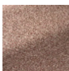
B7673008 Fraise des bois