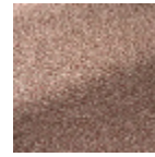
B7673008 Fraise des bois