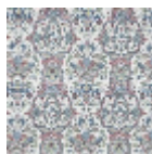
B7690003 Bleu garance