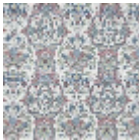
B7690003 Bleu garance