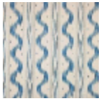
F1977001 Bleu ancien