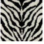
F2222002 Fond blanc