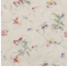
F2635001 Rose mauve