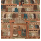
F2721001 Laque de chine