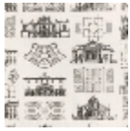
F2747001 Mine de plomb