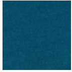
F2754015 Bleu nattier