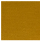
F2754041 Jaune d'or