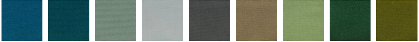
F2754015 Bleu nattier