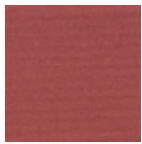
F2754034 Vieux rose