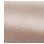
F2945014 Rose ancien