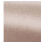
F2945014 Rose ancien