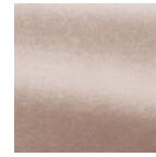
F2945014 Rose ancien