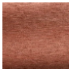
F2982026 Vieux rose