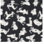
F2984001 Noir & blanc