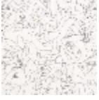
F2986001 Noir & blanc