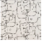
F2988001 Noir & blanc