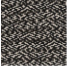
F3006001 Noir & blanc