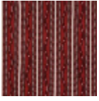
F3013001 Terre rouge