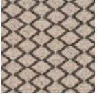
F3015001 Ombre naturelle