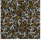
F3110001 Noir & or