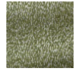
F3115013 Pois cassé