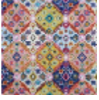
F3142001 Tutti frutti