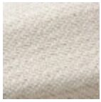
F3167001 Panna cotta