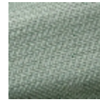
F3167008 Vert d'eau