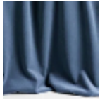
F3210019 Deep sky