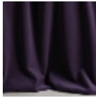
F3210021 God save the queen