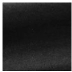
F3211006 Simple black