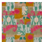
F3226002 Acid lime