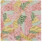
F3228002 Tutti frutti