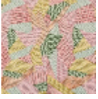
F3228002 Tutti frutti