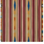
F3238001 Sable rose