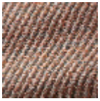
F3260002 Oiseau de paradis