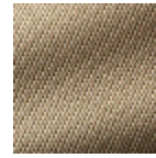
F3261009 Café au lait