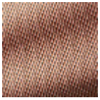
F3261002 Oiseau de paradis