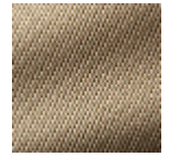
F3261009 Café au lait