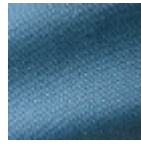
F3264006 Bord de mer