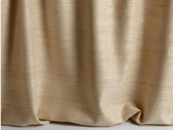
← Laize : 136,00 cm / 53,54 inch →