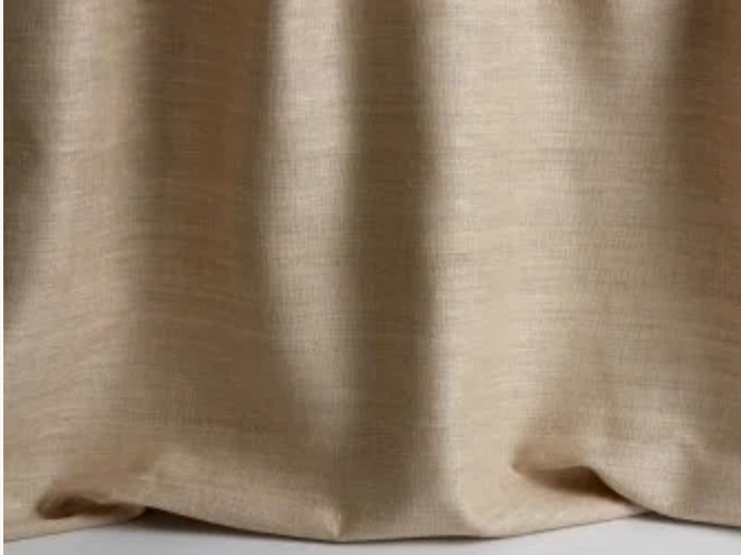
← Laize : 136,00 cm / 53,54 inch →