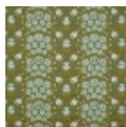
F3384002 Oeil du tigre