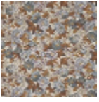
F3385002 Un jardin anglais