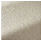
F3445002 E cru